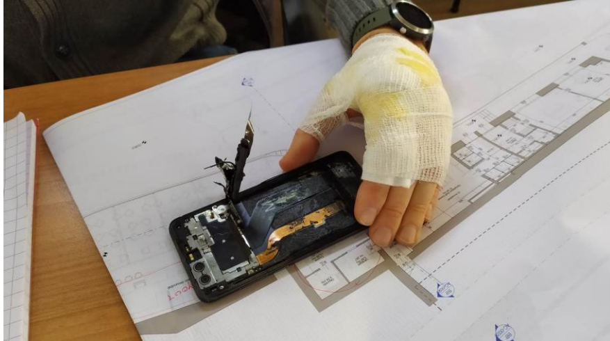
Skin burns after trying to remove from a mobile phone a battery that had started the thermal runaway process